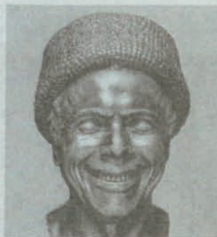
Messerschmidt's 'character heads,' clockwise from right: 'A Hypocrite and Slanderer' (1771-83), 'Capuchin' (ca. 1780), 'Childish Weeping' (1771-83), 'The Yawner' (1771-83), 'Just Rescued from Drowning' (1771-83) and 'The Artist as He Imagined Himself Laughing' (1777-81).